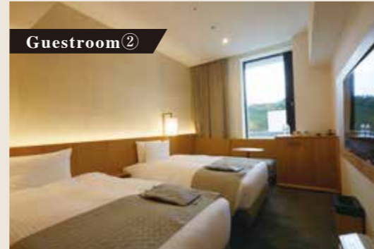
Twin Room with a view of the forest (Capacity:3 persons/Non-smoking)