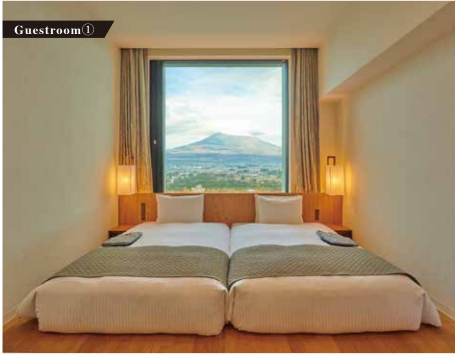
Twin Room with a view of Mt.Fuji (Capacity:2 persons/Non-smoking)

Located at Gotemba Premium Outlets®, HOTEL CLAD is an ideal base for shopping and sightseeing. We offer special plans for groups.