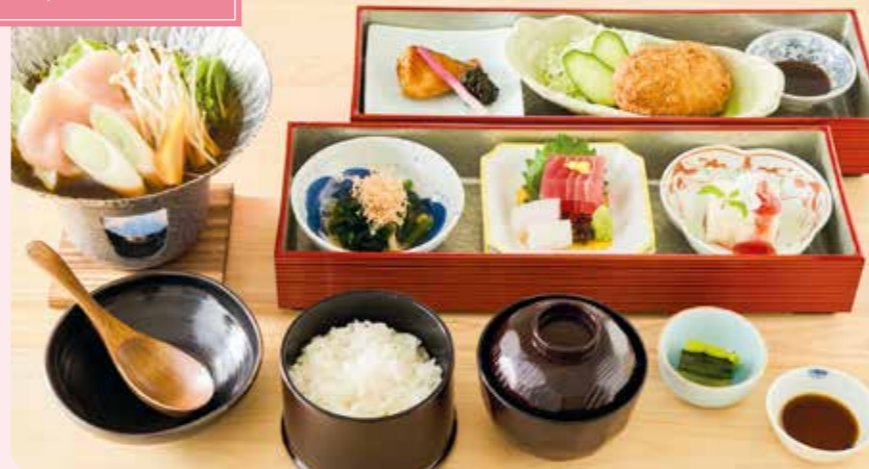
Appetizer, Sashimi, Grilled fish, Mishima croquette, Japanese variant of hot pot, Meal set (rice, pickles, miso soup)