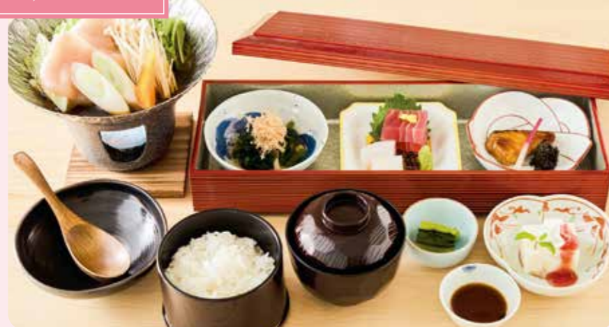
Appetizer, Sashimi, Grilled fish, Japanese variant of hot pot, Meal set (rice, pickles, miso soup)