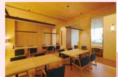
Konohana no Yu Dining—Hanagoromo

*Reservations are available for 10 or more guests. Seats may be separated depending on the number of guests in your group. *Reservations are accepted up to 7 days in advance. *Meals and tableware for the lunch change by season. (The photos are for reference.) *Details shown here may change without advance notice. *Children under 3 years old are not allowed in the public bath. *No tattoos. We do not allow the admission of people with tattoos (including stickers and paint). If the tattoo can be covered with two cover seals specified by our facility, you may enter. These cover seals are sold at the front desk for 300 yen each.