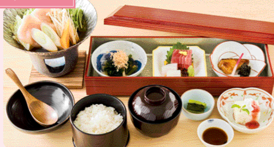
Appetizer, Sashimi, Grilled fish, Japanese variant of hot pot, Meal set (rice, pickles, miso soup)