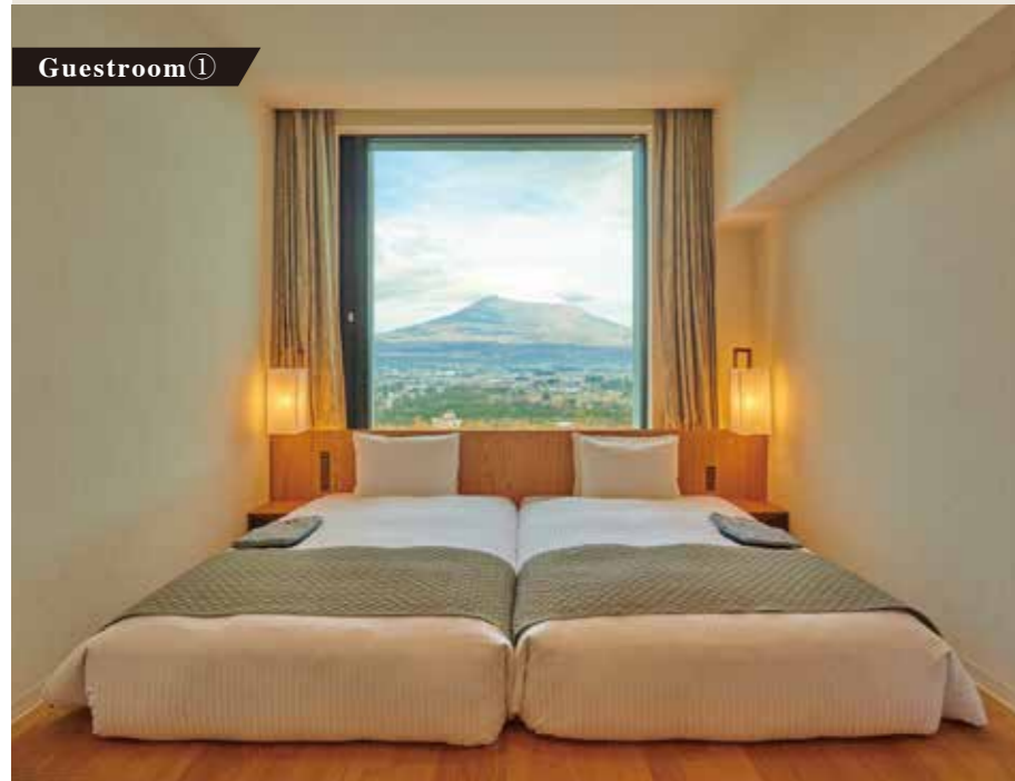
Twin Room with a view of Mt. Fuji (Capacity: 2 persons/Non-smoking)