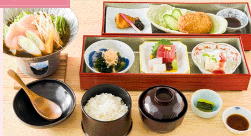
Appetizer, Sashimi, Grilled fish, Mishima croquette, Japanese variant of hot pot, Meal set (rice, pickles, miso soup)