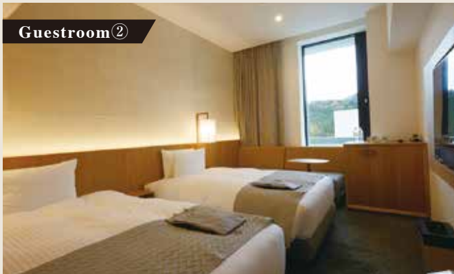
② Twin Room with a view of the forest (Capacity: 3 persons/Non-smoking)

*Each rate per person, double occupancy (including breakfast and dinner, consumption tax, and bathing tax). *Dinner and breakfast are served buffet style. (For a one-night stay with breakfast, there is a 5,000 yen discount from the rate on the right.) *Prices are subject to change, Please check when making a reservation. *Reservations are available for 10 or more guests. *Check-in at 3:00 pm, check-out at 10:00 am *Cancellation charge is 10% up to 14 days before, 30% up to 9 days before, 50% up to 3 days before, 100% up to 1 day before on the day reserved.