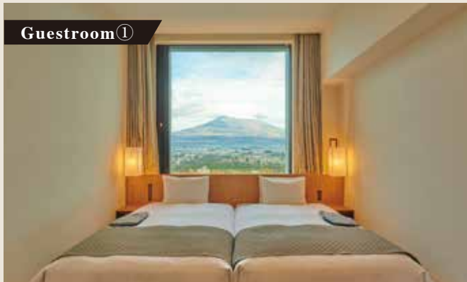
① Twin Room with a view of Mt. Fuji (Capacity: 2 persons/Non-smoking)

Located at Gotemba Premium Outlets®, HOTEL CLAD is an ideal base for shopping and sightseeing. We offer special plans for groups.